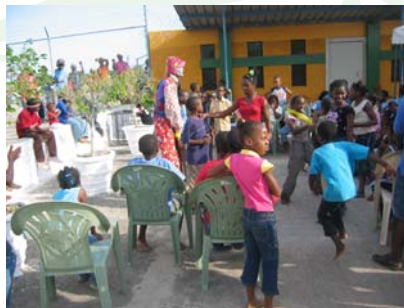
Children's Daycare at the Racetrack