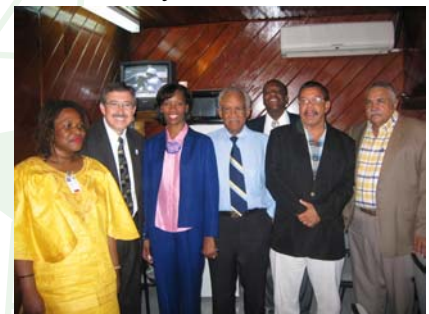
Our Executive Director with Jamaica's Racing Commissioners