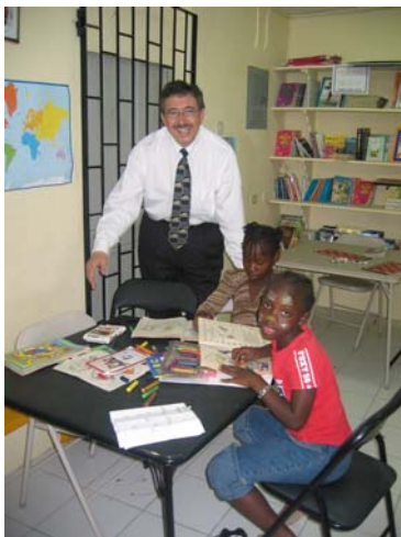
Our Executive Director with Children at the Daycare (top and bottom picture)