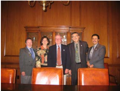
Members of the Executive Committee