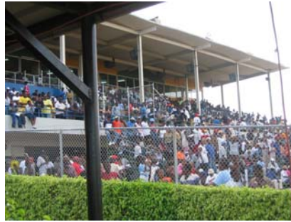
Caymanas Racetrack filled to capacity