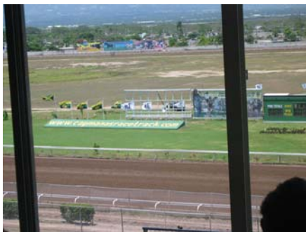
Caymanas Racetrack, Jamaica