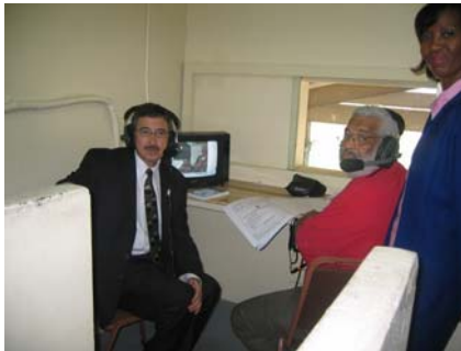
An interview with our Executive Director