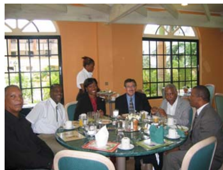
Breakfast Meeting with religious leaders of Jamaica