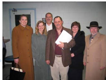
Potential Council Members for Canada/Woodbine Racetrack