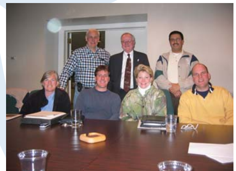
Arlington Park RTCA Council Members