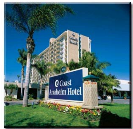
Coast Anaheim Hotel

New Dates for Annual Meeting, January 5-10, 2005: Due to conflicts with other important events in the racing industry, and the hotel with which we are in the process of signing a contract, we moved our announced date (NN: March/April, 2004) for our Chaplains' School and Annual Meeting to January 5-10, 2005. It is our hope to see all of our RTCA family attending this event. Please check your calendar and make note of the changes.