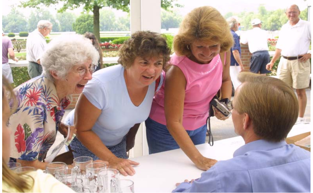
Pat Day greets fans at River Downs in his first Tour engagement